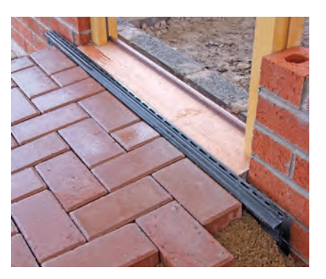
Step 6 Completed installation.

Either: Lay the paving to finish flush with the top edge of channel; OR Alternatively, the top edge of the channel provides a guide to cast a wet concrete pathway against.