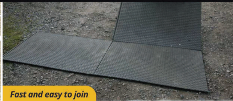
Fast and easy to join