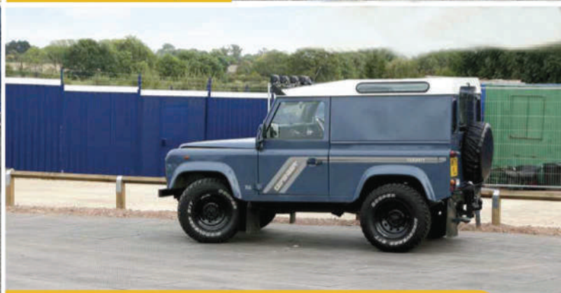
Ideal as a temporary construction site car park